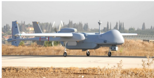
Figure 11: Heron TP by IAI

The new UAVs are required to enter benefit in 2018. A decent case of a small-scale ramble is the FULMAR settled wing smaller scale UAV which has a most extreme departure weight of around 20 kg. It was produced by Thales and Wake building, and it has endurance of 12 hours and range of about 90km. The best speed of this UAV is 100km/h, and the greatest height it can get to is 4000m with a payload of 8 kilograms [10].