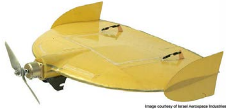
Figure 3: MOSQUITO by IAI

The somewhat bigger Spy the Mosquito developed by IAI (figure 3) is worked by a two-man team and has double the range, IAI said. Every one of the autonomous MAVs can fly for an hour while transmitting pictures back to their administrators.