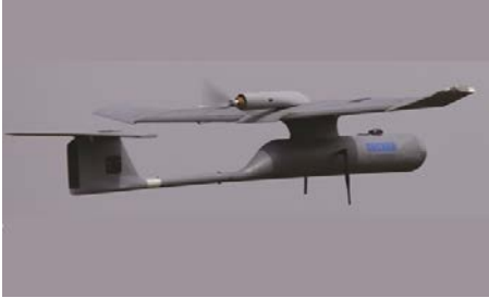
Figure 2: SUCHAN UAV

leading the development of MAVs and mini UAVs to meet the requirements of India's military and civil forces. The organization, which was previously succeeded in the development of three MAVs (Black Kite, Golden Hawk, and Pushpak), is now developing a mini UAV named Suchan (figure 2). These micro air vehicles are man-portable and have image processing capabilities, besides, these portable GCS commands, control and display, optical flow-based obstacle avoidance; and horizon detection using computer vision techniques.