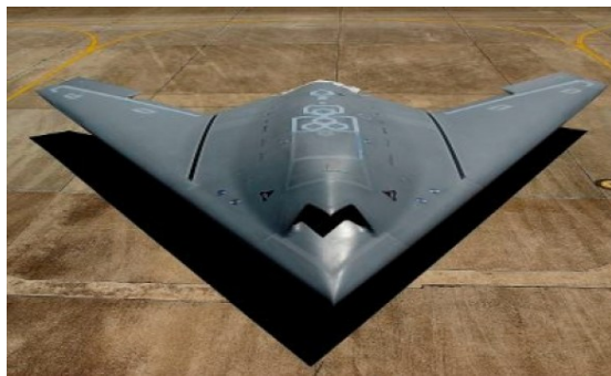
Figure 13: ARUA/GAHATK being developed jointly by DRDO and ADE

surveillance, long-range target photography, and designation of targets for other aircraft to attack [10]. (HALE) Unmanned airborne vehicle (UAV). AURA is being intended to be a strategic stealth airplane ready to convey laser-guided weapons. Preliminary design pictures demonstrate it to be fueled by a locally manufactured Kaveri turbofan, and furnished with inner weapons coves. The vehicle can work at the highest elevation of 30,000 ft out to scope of 300 km, with an all-up weight of 1.5 tons [10]. The program was begun in 2009 and has been halted and restarted a few times from that point forward. The most recent restart in 2014 pursues a coordinated effort with the Aeronautical Development Authority (ADA) and has seen the AURA restored under the name Ghatak (Lethal). The AURA/Ghatak is relied upon to be flown by numerous Indian offices, for example, the Aeronautical Development Establishment (ADE), the Defense Electronics Application Laboratory (DEAL), the Defense Avionics Research Establishment (DARE), and the Gas Turbine Research Establishment (GTRE) – all divisions of the DRDO a fully developed flying prototype expected to be completed by 2023 (figure 13).