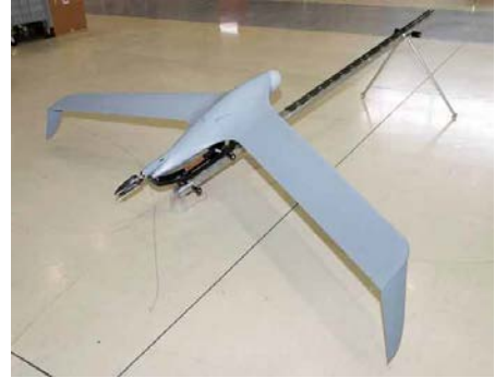
Figure 8: Bird-Eye 650D Developed by IAI

Bird-Eye 650D, (figure 8) a small tactical unmanned aerial system (UAS) designed and developed by MALAT Division of Israel Aerospace Industries (IAI), entered serial production in June 2016. The UAS is intended for a variety of military and paramilitary missions such as over-the-hill intelligence, surveillance, target acquisition and reconnaissance (ISTAR), patrol, urban operation, counter-terrorism, convoy escort, radio relay, and law enforcement. Its civilian applications include surveillance of disaster areas, water resource management, mapping, and powerline inspections [10].