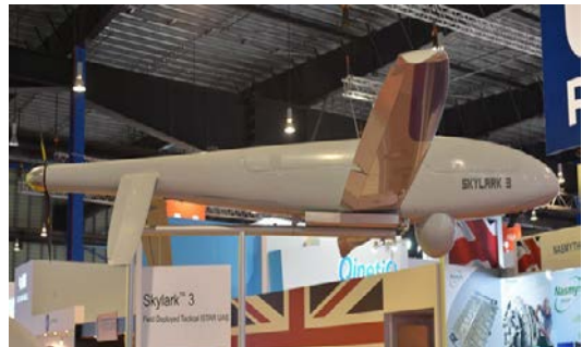
Figure 10: Skylark 3 developed by IAI