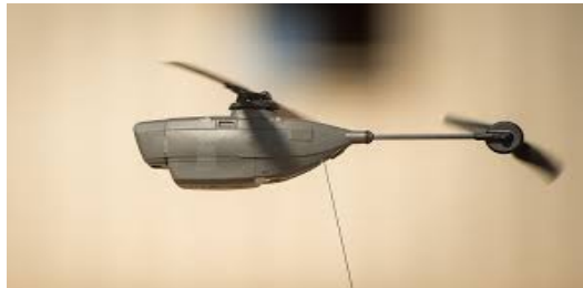
Figure 4: BLACK HORNET developed by Prox Dynamics

NAV – Nano Air Vehicles are proposed to be of the extent of sycamore seeds and utilized in swarms for purposes, for example, radar perplexity or possibly, if camera, impetus and control sub-frameworks can be made little enough, for ultra-short-range observation.