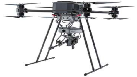
Figure 6: TIKAD Drone Developed by Duke Robotics

As shown in the figure 6, in September 2017, Duke Robotics has reported that Israel's Ministry of Defense has supported Duke Robotics' TIKAD ramble as creative future war zone innovation.