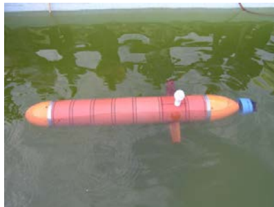
Figure 14: MAYA AUV

Autonomous Underwater Vehicles (AUVs) are not new. They have been used for oceanographic studies and for military purposes for several years. But, to we users of commercial survey services, it seemed that most works had concentrated on the vehicles themselves rather than on the use of such vehicles in surveying and site investigation. Nevertheless, the deployment of AUV-bourne sensors appeared to have the potential to solve the problems of accurately surveying deep-water sites. In the late 1990's BP surveyors and site investigation specialists vigorously pursued the technology and its application to oil industry requirements[18]. In 2001 we conducted our first commercial surveys using the technology. This paper outlines our experiences, contrasts them against our previous expectations, and suggests future directions.