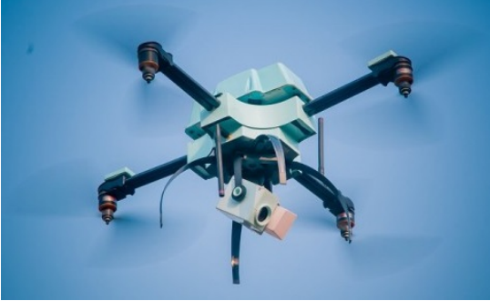
Figure 5: NETRA jointly developed by Idea-Forge and DRDO

Notwithstanding that, the in-fabricated safeguard highlights enable Netra to profit to base for loss of correspondence or low battery.