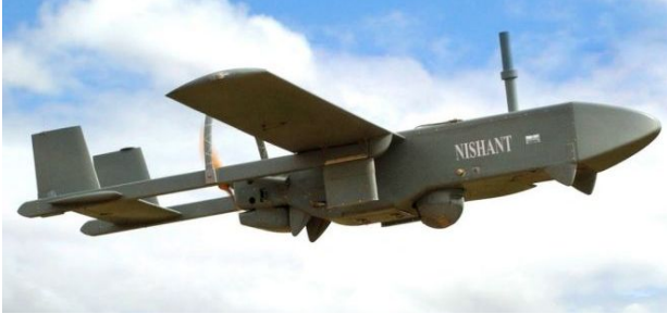
Figure 7: NISHANT UAV by DRDO

assignment, ordnance fire course, and harm appraisal as shown in the figure 7. Following quite a while of improvement and preliminaries, it was conveyed to the Indian Army in 2013.