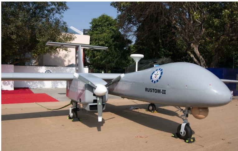
Figure 12: RUSTOM 2 developed by DRDO

The UAV takes into account concurrent task of various payloads for multi-mission necessities. India's purchase of 10 Heron TP proposes that ordinary turboprop-driven outfitted automatons are of constrained utility to India and its Stealthy turbofan-driven American Avenger and India's own Ghatak UCAV Projects which will be a genuine distinct advantage concerning Indian Military.