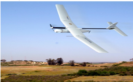
Figure 9: Searcher 2 developed by IAI

The drive framework utilizes dual channel perpetual magnet brushless engines. A controller turns off one channel while cruising as this requires less power. On the off chance that one of the frameworks comes up short, the control will consequently change to another framework, enabling the vehicle to proceed with the mission or drop and come back to the ground securely.